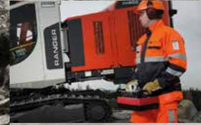
Full radio control