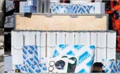
First service kit