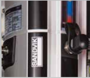
Sandvik central greasing unit