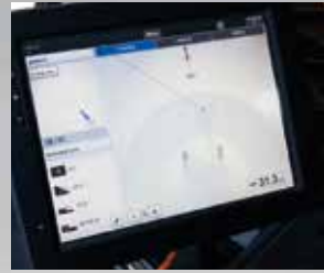
TIM3D navigation system