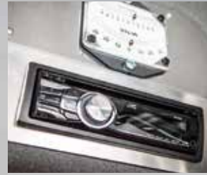
Radio and CD-MP3 player