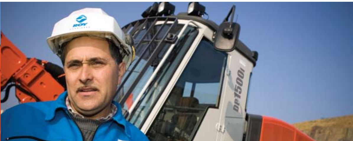
Gullwing-type doors make service easy